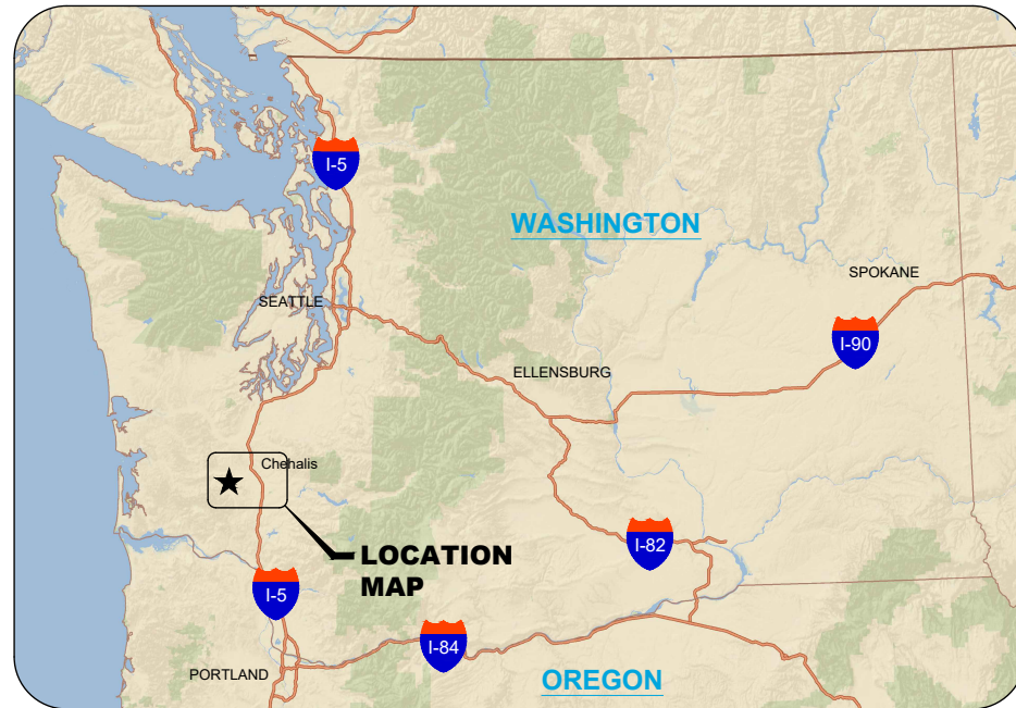
STATE MAP (NO SCALE)