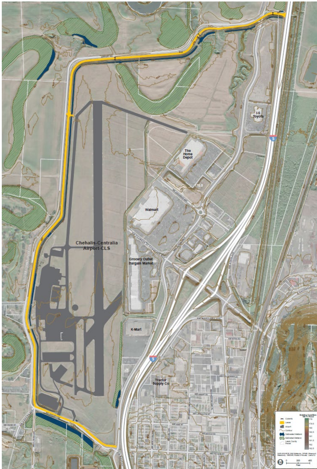
Figure 1. Chehalis Airport Levee Configuration and Wetland Map